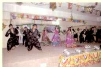
Glimpse of events in Vet-Ustav-2013