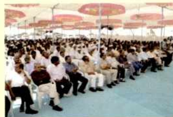
Invitees at Bhumipujan Programme