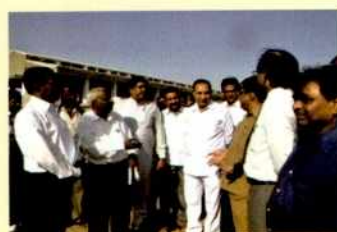
Visit of Bull Mother Farm at Amreli