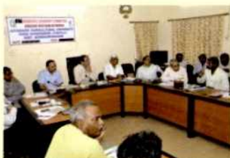
Active participation of progressive farmer in meet