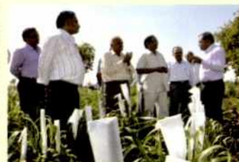
Scientist briefing research status

were present. Hon'ble VC discussed about the status of millet crop research of the centre with the scientists and appreciated their valuable contribution in millet crop research.