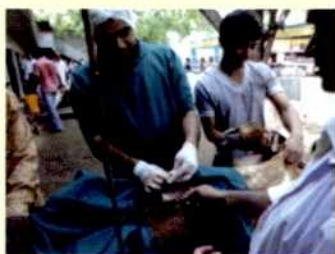
Clinicians operating animal