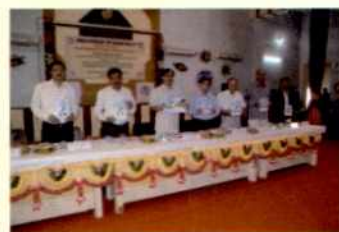
Guests are releasing souvenir on World Veterinary Day function