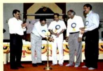
Inauguration of Annual Workshop of AICRP on Groundnut

The Kharif Annual Workshop of AICRP on Groundnut was held at Junagadh Agricultural University, Junagadh in collaboration with Directorate of Groundnut Research (ICAR) and Junagadh Agricultural