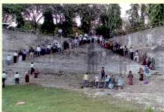
Staff and students at Shramyagna

A voluntary 'Shramyagna' was organized during June 4-5, 2013 for removal of debris and de-silting from the Paritalav. In this programme Staff and NSS Volunteers from different Colleges actively participated and removed about 10 tractor trailer load of silt and debris from the bottom of the Paritalav. Hon'ble Vice Chancellor Dr NC Patel also joined in this noble task and encouraged the students and staff.