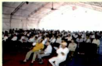
Memorable snaps of Mega Krishi & Pashu-Arogya Mela Seminar-2013