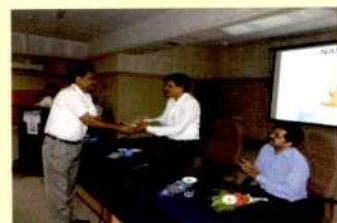
Inauguration of CLFMA Orientation Programme