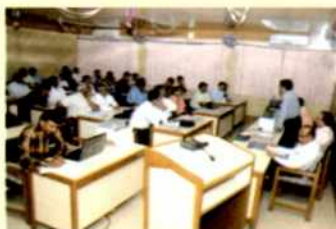
Pre-seasonal training for extension personnel

Pre-seasonal training for extension personnel of Saurashtra was organized at JAU, Junagadh during April 17-18, 2013 in which extension workers/ officers of Department of Agriculture participated and updated their knowledge of agricultural technologies.