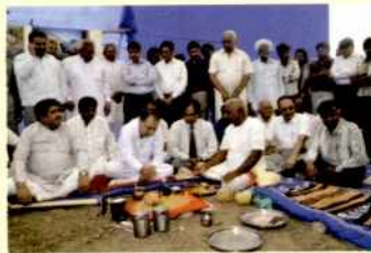
Bhumipujan Programme for construction of new Agriculture College building at Amreli