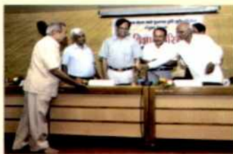
Inauguration of seminar on Varsha Vigyan