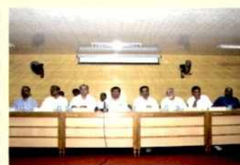
Meeting of SC/ST Cell