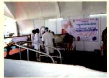
Veterinary Experts examining animal